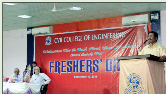
Chairman Addresses the Freshers

dances and other programmes. There were many performances and events organized by the seniors. A few of the events were J.A.M, Essay Writing, Antakshari, Picturesque, Mind Mapping, etc. Ingenious skits, and many more acts, made the day a huge fun filled party. It was a colorful occasion as freshers were dressed in their best attire. All in all, the fresher's day was a grand affair and everybody went home with loads of memories that they would cherish for long.