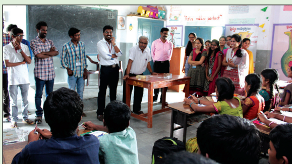
Awareness Session at ZPHS