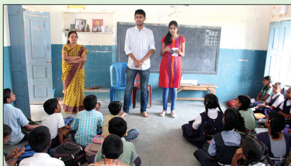
ARISE, An Outreach Programme