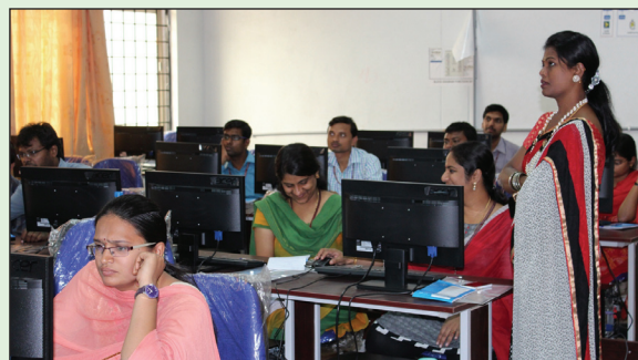
Hands on Session