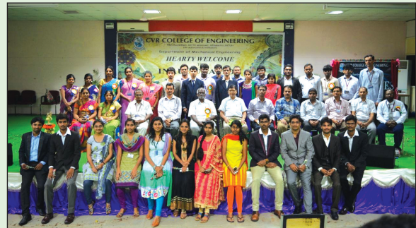
Inaugural of Students Association