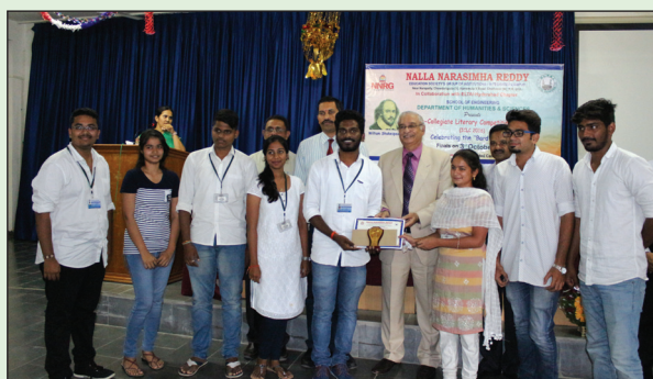
CVRCE Bags First Prize for Skit