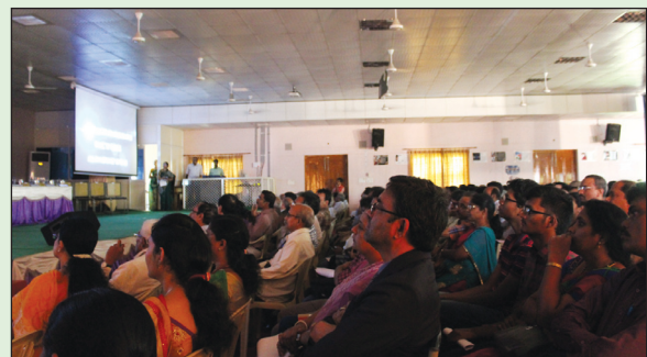
Orientation Day 2016