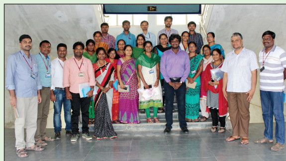
Participants at the Workshop