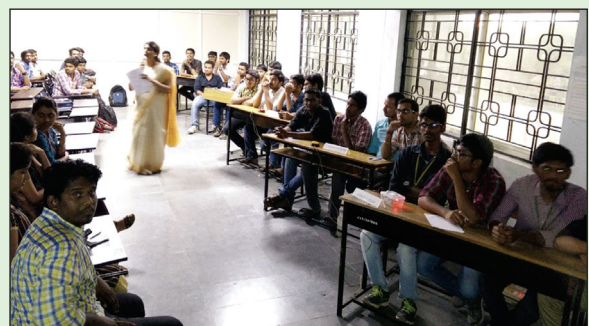
Technical Quiz Electrocruiise