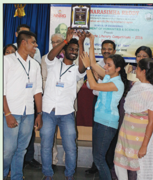
Best College Prize