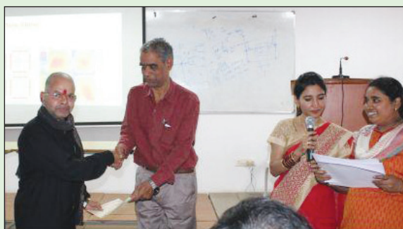
Distribution of Certificates