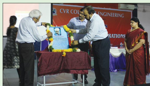
Engineers' Day Celebrations