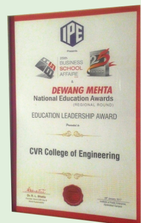
Dewang Mehta Educational Leadership Award

The Education Leadership Award is intensely researched into, to produce a shortlist of institutions that are doing extraordinary work in their domain and track the record of their achievements. The shortlist is then reviewed by a jury comprising senior professionals, senior leaders, researchers and academicians from across the globe