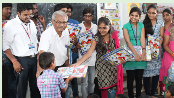
Social Outreach at ZPHS