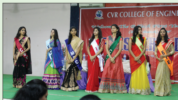
Contestants at the Mr & Ms CVRCE Competition