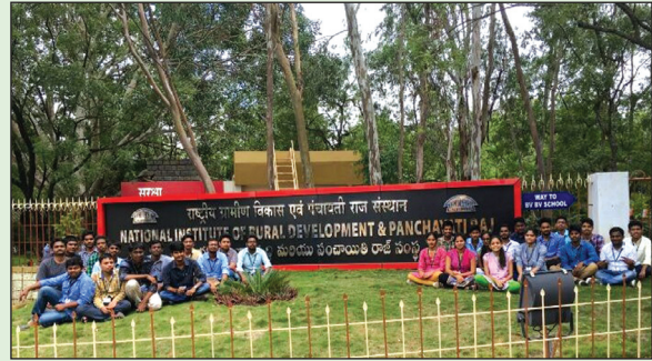
Students at NIRD Campus

Recognized internationally as one of the UN-ESCAP Centers of Excellence in HRD, it builds capacities of rural development functionaries, elected representatives, academicians and young students through inter-related activities of training, research and consultancy. The Institute is located in the serene rural surroundings of Rajendranagar about 15 km away from Hyderabad.