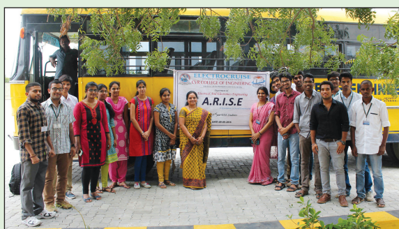
The ARISE Team