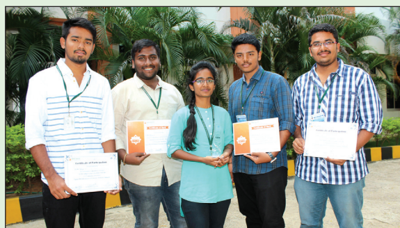
Prize for Best Short Film

2. Students of Civil and EEE students participated in the Movie Making competition in Vignan Bharathi Institute of Technology on 27th September, 2016 in IEEE fest. The students won the first prize in the competition.