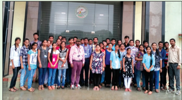
Visit to KTPS

plants of Telangana Power Generation Corporation Limited (TSGENCO). The students visited Unit V & VI of 150X2 MW capacity. At a distance of 11 km from Palvoncha, 40 km from Bhadrachalam, 102 km from Khammam and 297 km from Hyderabad, Kinnerasani Dam is located at Yanambile in Khammam district of Telangana. The dam is situated inside Kinnerasani Wildlife Sanctuary. The dam provides water to Kothagudem Thermal Power Station at Palvoncha for power generation. It also provides irrigation facilities to the nearby farmers through lift irrigation.