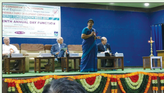
Principal at REDC

The Renewable Energy Development Corporation, Telangana conducted an energy conservation week from 14-21 December, 2016, under the banner of "Energy Conservation Mission", in the Institution of Engineers,