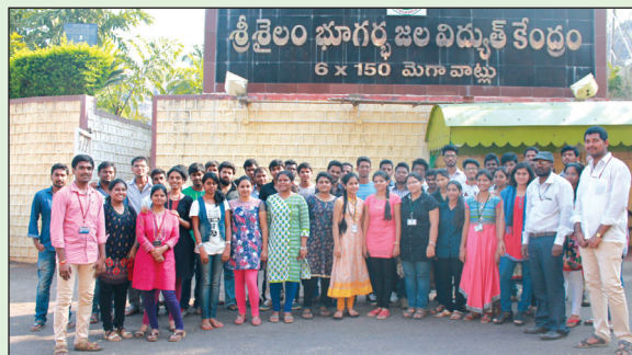
Visit to Srisailam